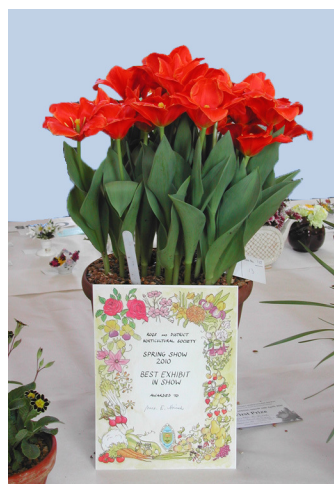
THE ROYAL HORTICULTURAL SOCIETY'S AFFILIATED SOCIETY'S CARD FOR THE BEST EXHIBIT IN THE SHOW - Mrs E Hinch