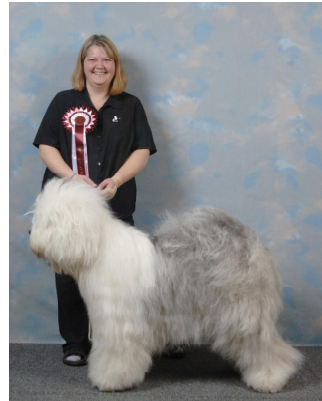
Phoebe in Dec 2009

Phoebe is our bitch whom we imported from Belgium in March 2009 from the famous aus dem Elbe-Urstromtal Kennels. At just 20 months old she obtained her first Reserve Best Bitch Challenge Certificate at the Midland Old English Sheepdog Club Championship Show in December 2009. This award sees her eligible for entry into the prestigious Stud Book and qualifies her for Crufts for life. This year Phoebe was entered into the Yearling Bitch class and won Reserve place, which, considering the disaster the night before, we were very pleased with.