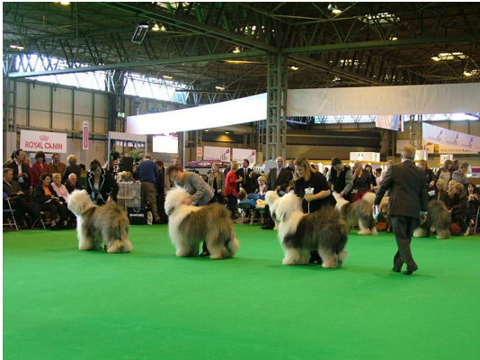
Max at Crufts 2010