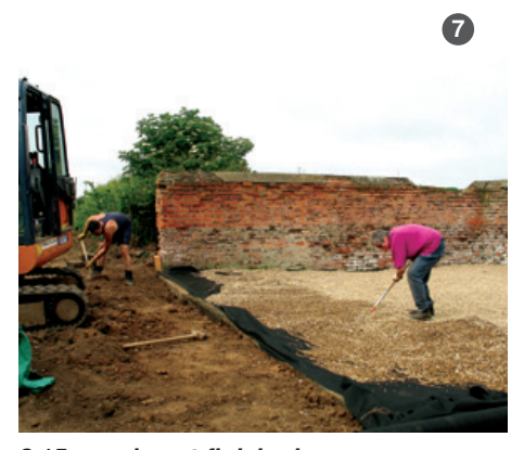
2.15 pm almost finished