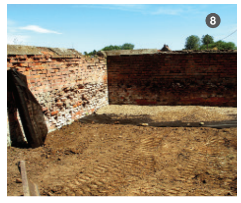
3.45 pm job done!