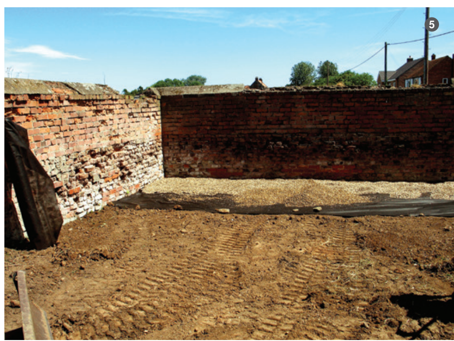
12.00 pm halfway through might wish to undertake a project or offer their suggestions.

Perhaps a seat, or a picnic table with maybe a commemorative plaque? Possibly the pupils of Roos School