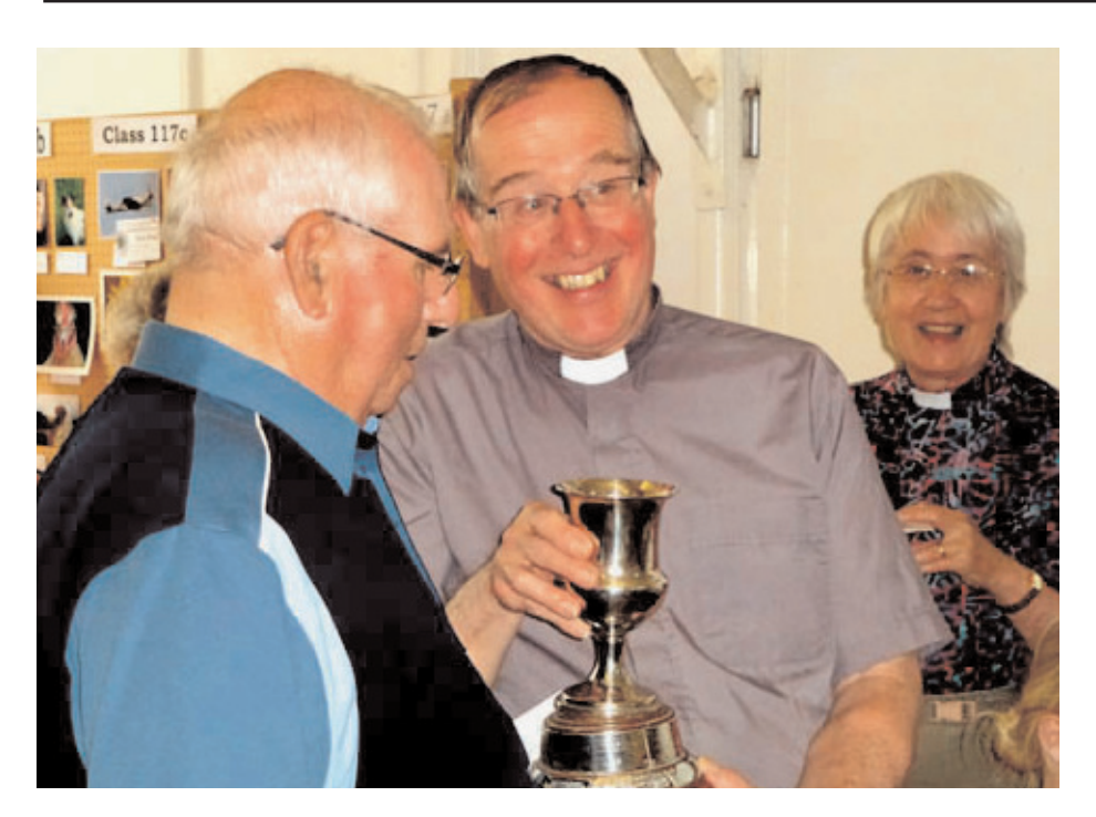
The 69th Roos & District Horticultural Society's Summer Show was held on Saturday July 2nd in Burton Pidsea Memorial Hall and in our greatly admired new marquee. This had been recently purchased with monies arising from our successful application for funding from the RES Pre-Construction Fund.