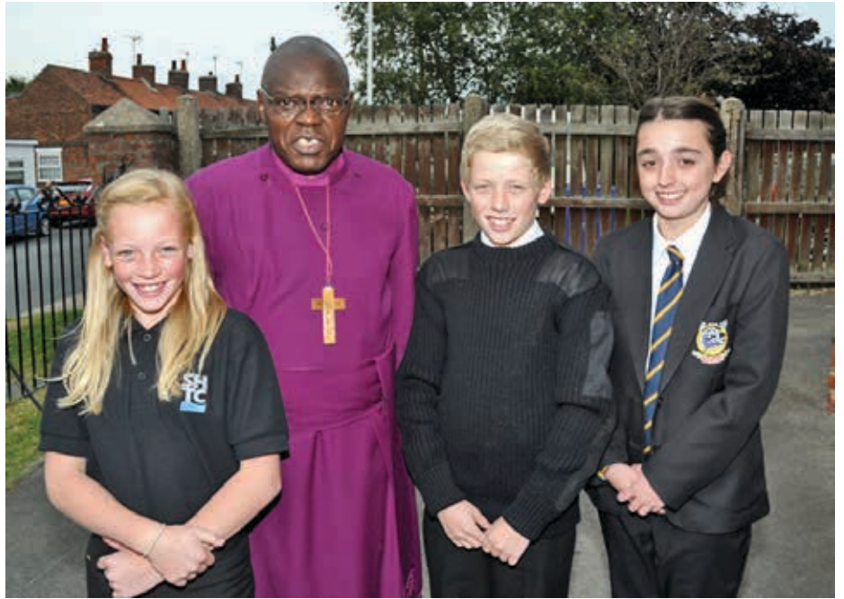
The Archbishop with Lifestylers who raised £1000 towards the cost of the bells.