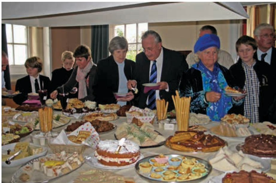
Roos Bells Dedication Afternoon.