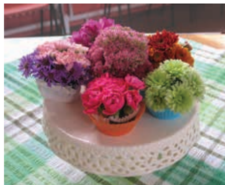
Roos Bell Table Decorations.