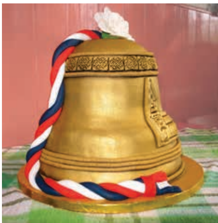
Roos Bell Dedication Celebration Cake.