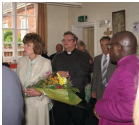
Roos Bells presentation and thanks.