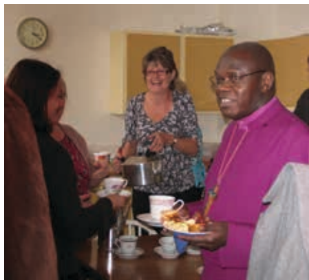
Archbishop Sentamu sharing a joke.