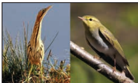
Yorkshire Wildlife Calendar 2013