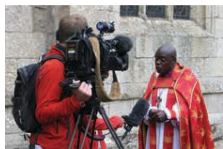
Roos Bells Dedication TV interview.