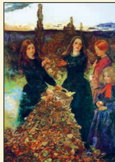
Autumn Leaves - Sir John Everett Millais

The year has certainly passed quickly and gardeners have, at times, felt despondent with the weather conditions. The late frosts and wet weather in the Spring had a marked effect on seed germination and growth of plants. It is also noticeable this year that there has been much less produce from the vegetable garden or orchard to prepare for our deep freezers!